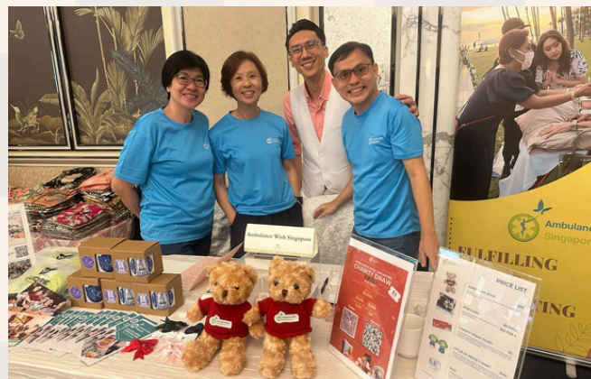
AWS volunteers helping out at the event booth

The afternoon fostered meaningful discussions about life's important transitions, where we explored how thoughtful planning becomes both an act of care and a celebration of life's most precious moments.