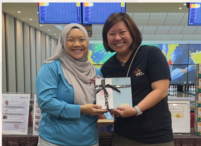
Exchanging token of appreciation between Ambulance Wish Singapore and Shell

Ambulance Wish Singapore extends our gratitude to Shell Network of Women (NOW) for their support at the Charity Bowl on 4 July 2025.